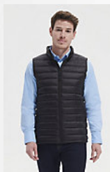
SOL'S WILSON BW MEN 02889