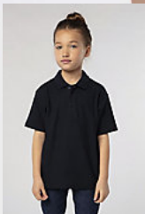
SOL'S SUMMER II KIDS 11344