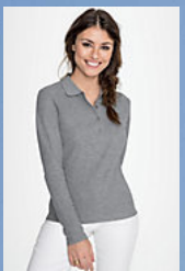
SOL'S PODIUM 11317