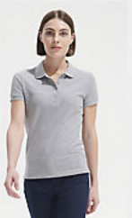
SOL'S PEOPLE 11310