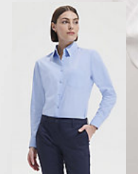
SOL'S EXECUTIVE 16060