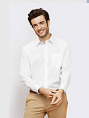
SOL'S BALTIMORE 16040